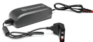
HUSQVARNA BATTERY CHARGER QC80F 967 62 83-01