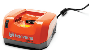
HUSQVARNA BATTERY CHARGER QC330 330W 967 09 14-02