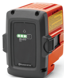
HUSQVARNA BATTERY BLI20 4.0AH 967 09 17-01