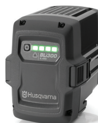
HUSQVARNA BLI300 BATTERY 9.4AH 967 07 19-01