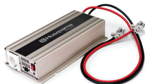
HUSQVARNA INVERTER VI600F 967 62 85-02