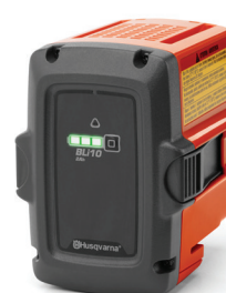
HUSQVARNA BATTERY BLI10 2.0 AH 967 09 16-01