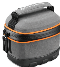
HUSQVARNA BATTERY BAG 585 37 18-01