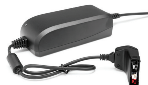
HUSQVARNA CHARGER QC500 967 09 15-02