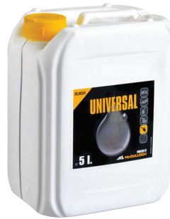
OLOO24 - MINERAL CHAIN OIL - 5 LITRE 577 61 64-24