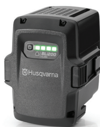
HUSQVARNA BATTERY BLI200 5.2AH 967 09 19-01