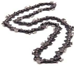
SAW CHAIN H37 CHAMFER CHISEL 3/8" MINI 1.3 576 93 65-40