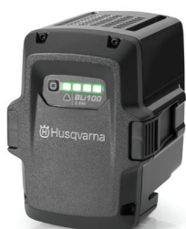
HUSQVARNA BATTERY BLI100 2.6AH 967 09 18-01