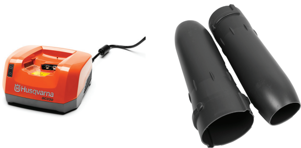
HUSQVARNA BATTERY CHARGER 576 58 18-01 QC330 330W 967 09 14-02