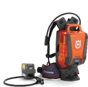
HUSQVARNA BLI550X BACKPACK HUSQVARNA CHARGER QC500 967 09 31-01 967 09 15-02