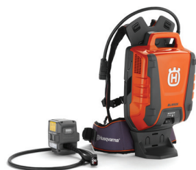
HUSQVARNA BLI950X BACKPACK 967 09 32-01