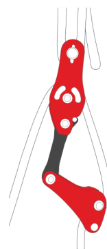
Engaged (during lowering)